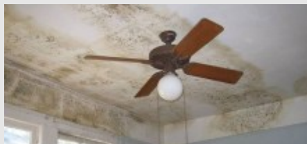
Anti mildew treatment

Hotels, Restaurants, Kitchens, Residential facilities, Commercial establishments, Schools, Institutions, Warehouses, Greenhouses, Waste disposal, Factories, Animal houses, Healthcare facilities & Food processing plants.